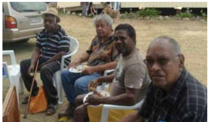
Monthly Church lunch