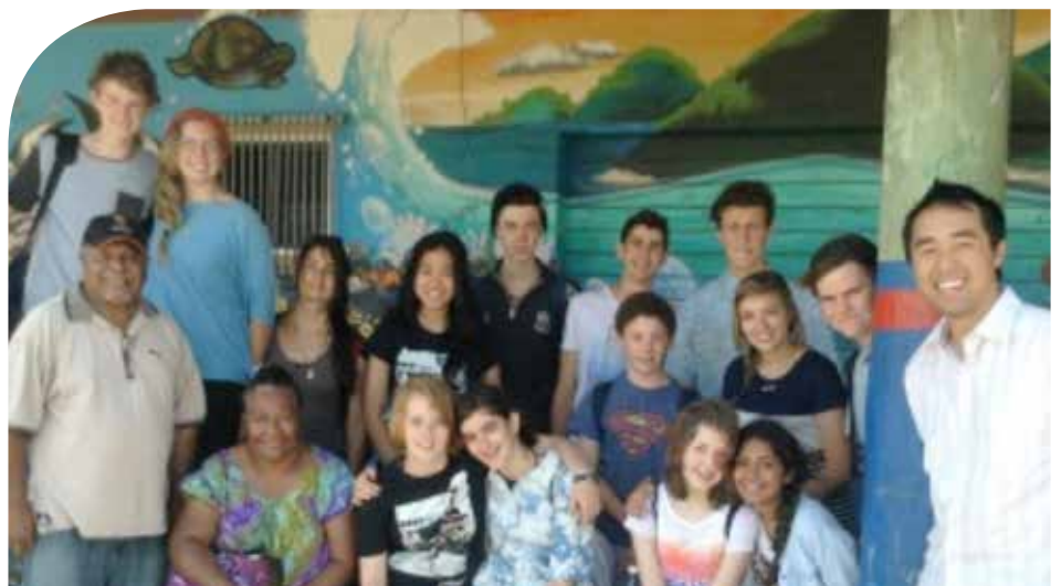
visiting ministry team