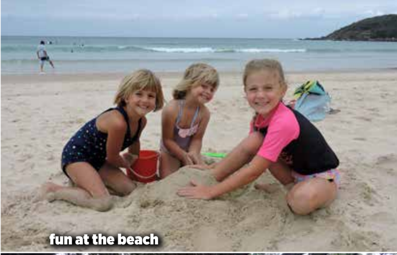
fun at the beach