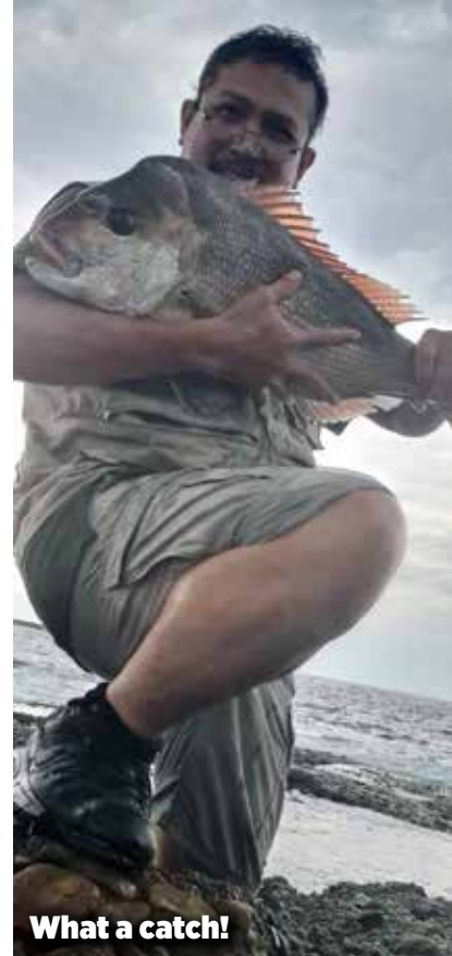
What a catch!

Let us hold fast the confession of our hope without wavering, for He who promised is faithful. (Hebrew 10: 23)