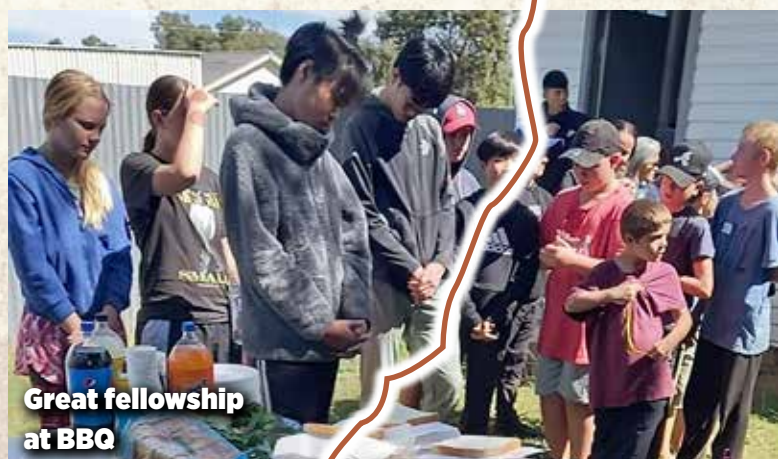
Great fellowship at BBQ